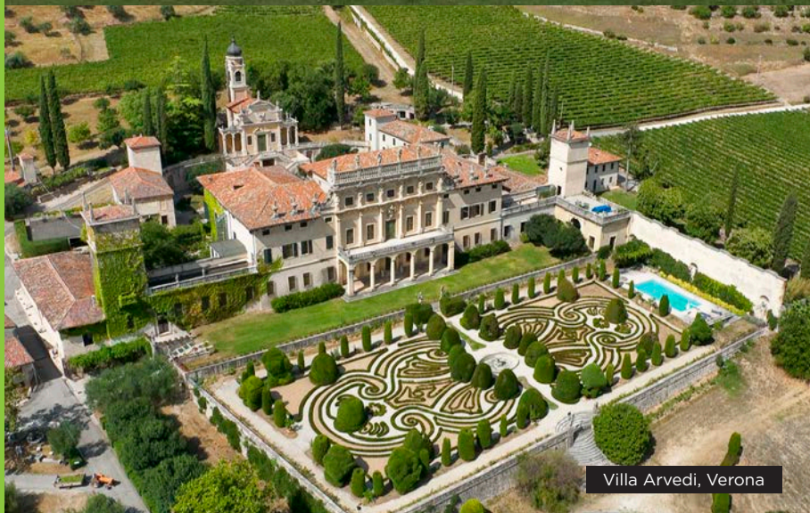
Villa Arvedi, Verona