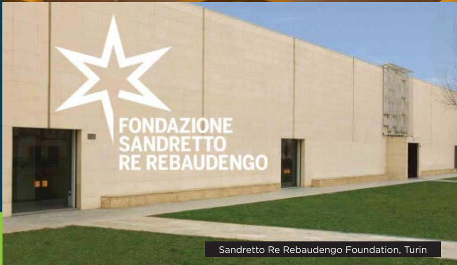
Sandretto Re Rebaudengo Foundation, Turin