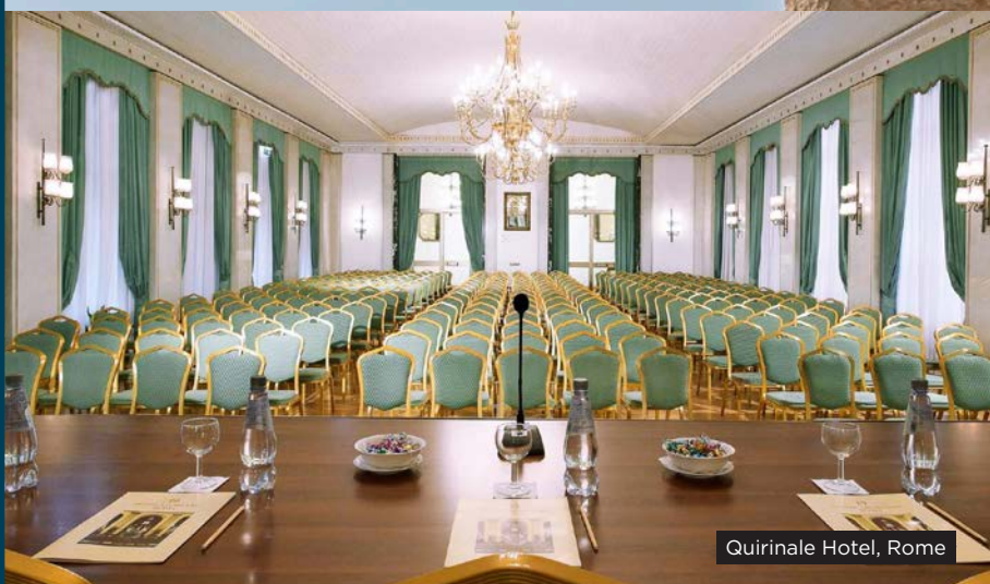
Quirinale Hotel, Rome

All this is realised in an itinerant route, a journey that began on Saturday 1 April in Rome in the magnificent lounges of the Quirinale hotel , will continue on Saturday 1 July in Turin , at the Sandretto Re Rebaudengo Foundation , immersed in contemporary art, and will culminate on Saturday 7 October in Verona in the fabulous Villa Arvedi in 3 stages, with specific actions and objectives.